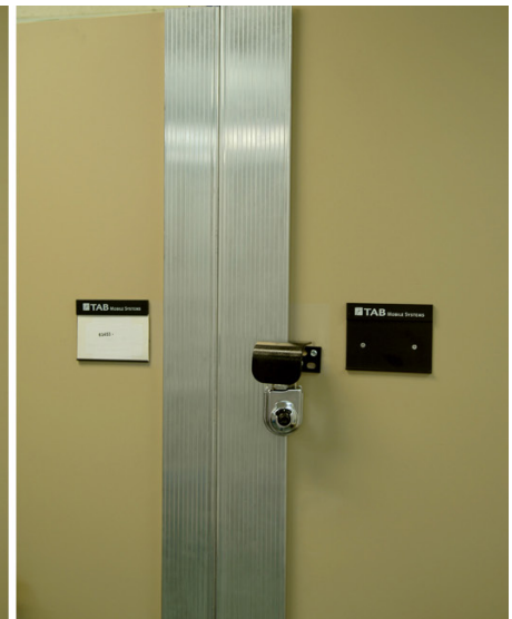
End Panel assembly fully closed & locked