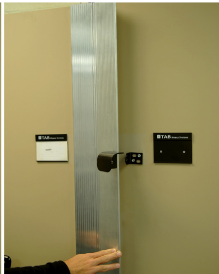
End Panel assembly being closed