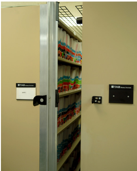
End Panel assembly open

The solution consists of an ultra secure top screen which is a flat black offset assembly that is mounted on top of cabinets or shelving. It also consists of an ultra secure end panel assembly (or shelving mount) that is attached on a hinge that covers the side openings between the cabinets and shelving.