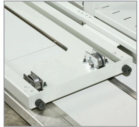
Low Profile Deck and Carriage