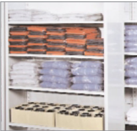
Retail Stock Storage