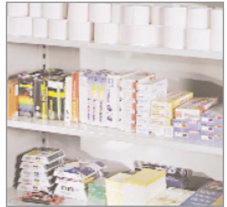
Office Supply Storage