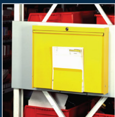
WW-100CH Chart Holder