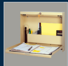
WW-100SC Self-Closing Door

WallWrite® workstations are available in 15 standard paint colors, 12 standard laminate finishes. Custom match paint colors are available. Contact TAB for more information.