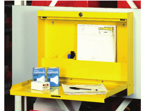
WW-100 Easily mounts to wall, column, or shelving rack.