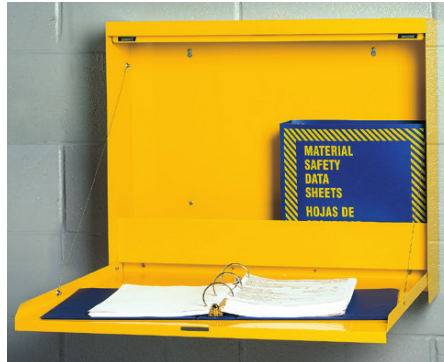
WW-301 MSDS WallWrite® • Helps meet Federal Hazard Communications Standard • Stores MSDS binders or other important reference materials • Highly visible and easily accessible • Pull-down door doubles as worksurface