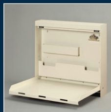
WW-102 Economy WallWrite