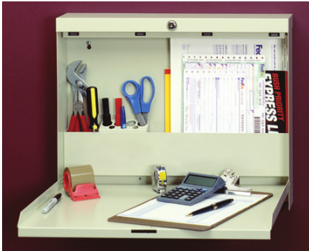
WW-100 Convenient workspace for a wide variety of tasks.

The WallWrite® wall-mounted workstation is ideal for high-traffic areas in industrial and commercial environments where temporary workspace is needed, including: loading docks, warehouses, factory floors, maintenance and supply rooms, inventory areas, public planning, shipping and receiving, and computer rooms. WallWrite stations can be installed virtually anywhere and can be mounted at a standing or seated height for maximum user convenience, and heavy-duty steel construction and a powder-coated finish allow it to stand up to rugged work environments.