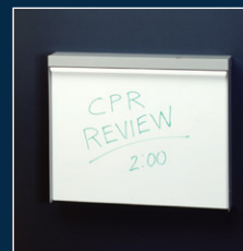
WW-101WB White Board