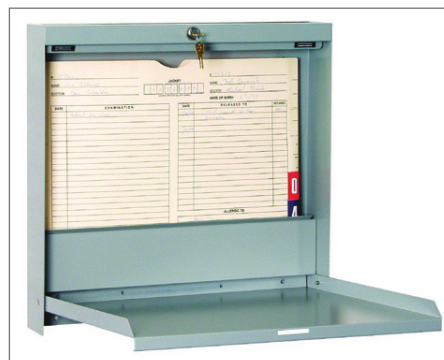
WW-100DB DropBox™ WallWrite® • Fast, easy, confidential filing • Convenient worksurface for high-traffic area • Available in x-ray and standard sizes • Available with or without lock • Slot dimensions (in.): 3/4"D x 18 3/4"W