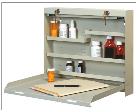
WW-400 DrugStor™ • Secures narcotics and other pharmaceuticals • Two locks can be keyed alike or differently for increased security • Four adjustable shelves on 1 3/4" increments

WallWrite® workstations are ideal for healthcare environments where placing supplies and documents closer to the point of care is vital to enhancing the patient experience. TAB offers a number of specialized workstations specifically designed for the needs of the healthcare industry that meet both HIPAA compliance and ADA requirements.