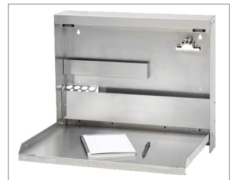
WW-103 Economy WallWrite® II • Stores oversized files or older x-ray jackets and film • Available without lock • Dimensions (in.): 19 3/8"H x 20"W x 3/38"D (Shown in stainless steel)