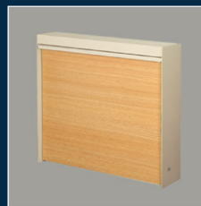
WW-101LP Laminate Panel